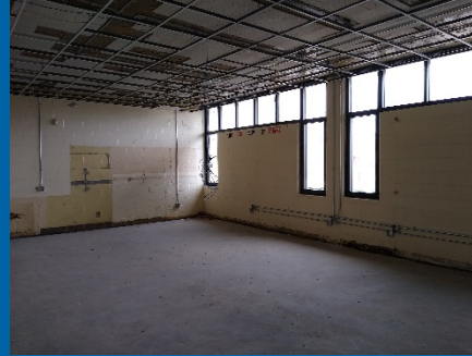
Install Conduit in Classrooms