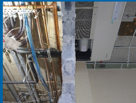
Install Condensate Drains and Line Sets to FCUs in Building 2010