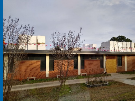
Continue Demolition and Replacement of Roof