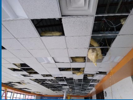
Install New Lighting in Media Center